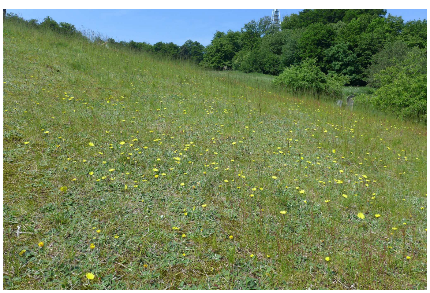
Dry acidophilous grasslands